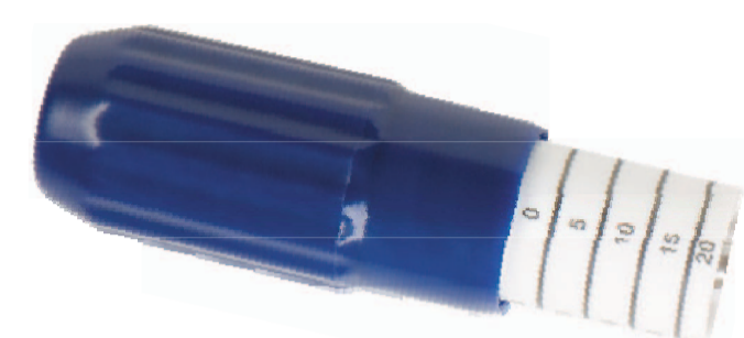
mild Depth Guide Ensures Depth of Cutting Instrument