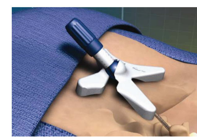
mild Portal Stabilizer Minimizes Medial & Lateral Movement Helps Control Cutting Angle