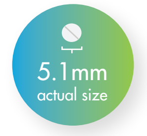
Incision smaller than the size of a baby aspirin No implants left behind, only a Band-Aid